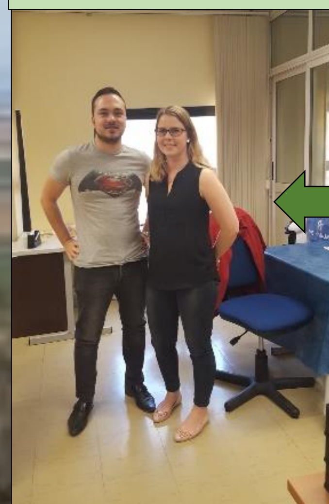
University of Malta Research Librarians